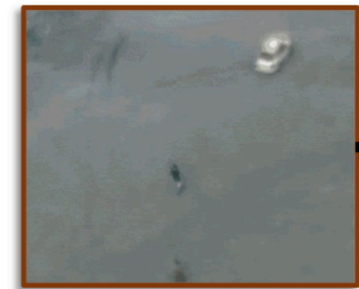
Image degraded with atmospheric turbulence