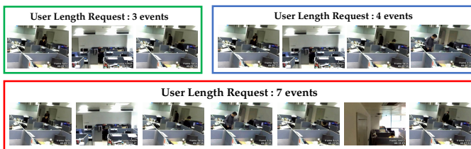
Fig. 4. The figure shows an illustrative example of scalability in generating summaries of different length based on the user constraints for the Office dataset. Each event is represented by a key frame and are arranged according to the l_2 norms of corresponding non-zero rows of Z .

Results. Apart from indicating the representatives for the summary, the non-zero rows of Z also provides information about the relative importance of the representatives for describing the whole videos. A higher ranking representative frame takes part in the reconstruction of many frames in the multi-view videos as compared to a lower ranked frame. This provides scalability to our approach as the ranked list can be used as a scalable representation to provide summaries of different lengths ( analyze once, generate many ). Fig. 4 shows the generated summaries of length 3, 4 and 7 most important events (as determined by the method described above) for the Office dataset.