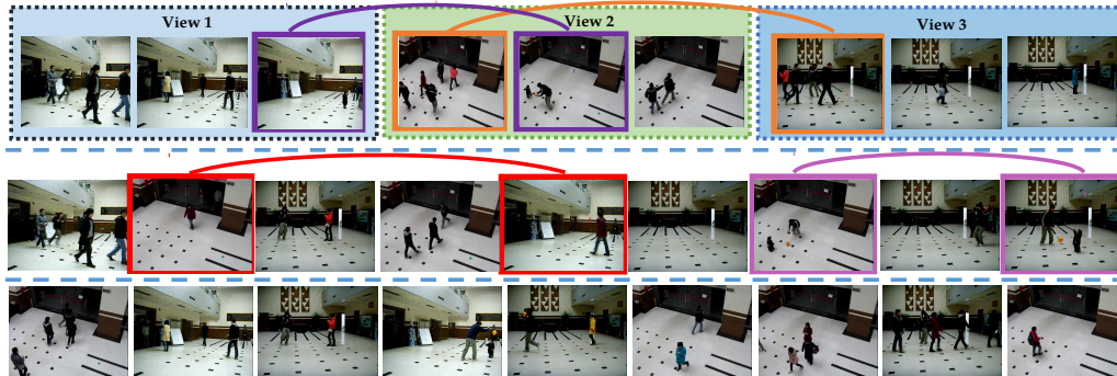
Fig. 2. Some summarized events for the Lobby dataset. Top row: summary produced by SparseConcate [6], Middle row: summary produced by ConcateSparse [6], and Bottom row: summary produced by our approach. It is clearly evident from both top and middle rows that both of the single-view baselines produce a lot of redundant events in summarizing multi-view videos, however, our approach (bottom row) produces meaningful representatives by exploiting the content correlations via an embedding. Redundant events are marked with same color borders. Note that, although the frames with same color border look somewhat visually distinct, they essentially represent same events as per the ground truth in [8].