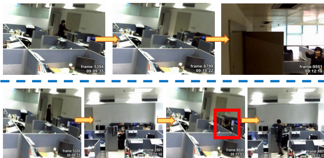
Fig. 5. Sequence of events detected related to activities of a member ( A_0 ) inside the Office dataset. Top row: Summary produced by method [20], and Bottom row: Summary produced by our approach. Sequence of events detected in top row: 1st: A_0 enters the room, 2nd: A_0 sits in cubicle 1, 3rd: A_0 leaves the room. Sequence of events detected in bottom row: 1st: A_0 enters the room, 2nd: A_0 sits in cubicle 1, 3rd: A_0 is looking for a thick book to read (as per the ground truth in [20]), and 4th: A_0 leaves the room. The event of looking for a thick book to read (as per the ground truth in [20]) is missing in the summary produced by method [20] where as it is correctly detected by our approach (3rd frame: bottom row). This indicates our method captures video semantics in more informative way compared to [20].

seven single-view baselines generate a multi-view summary by either applying the method to each video separately or concatenating all the videos into a single video.