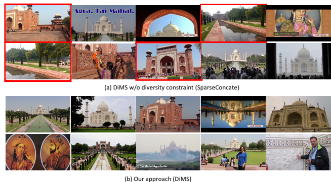
Fig. 2. Role of diversity constraint in summarizing videos of Taj Mahal. (a) DiMS w/o diversity constraint (i.e., SparseConcat baseline), and (b) Our approach (DiMS). We show the top 10 segments generated using 10% summary length. As can be seen from (a), SparseConcat baseline finds redundant segments (marked with red color borders) since it does not consider diversity of multiple videos. Our approach DiMS, in contrast, generate a more informative summary capturing different but also important information described in the videos by exploring the complementary information.

Comparison with State-of-the-art Methods. Table II shows the topic-wise mean F-measure performance of our method along with two multi-video summarization methods on Tour20 dataset. Following observations can be made from Table II: (1) Our method achieves the highest overall score of 0.613, while the strongest baseline reaches 0.517 on the Tour20 dataset. Our