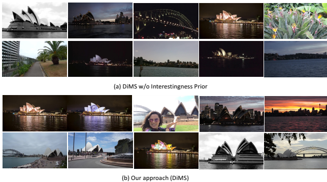
Fig. 3. Role of interestingness prior in summarizing videos of Sydney Opera House. (a) DiMS w/o interestingness prior (by setting Q^{(v)} = I in problem (7)), and (b) Our approach (DiMS). We show the top segments generated using 10% summary length. As can be seen, optimizing only for representativeness misses some crucial segments (e.g., the girl taking a photo by pointing to the opera house or segments showing several persons roaming around the house), which are indeed captured in our summary by jointly considering both representativeness and interestingness in the sparse optimization.

feature vector of a frame and then use temporal mean pooling to compute a single segment-level feature vector, similar to C3D features described in Sec. III-A. The spatio-temporal C3D features perform best, as they exploit the temporal aspects of activities typically shown in videos.