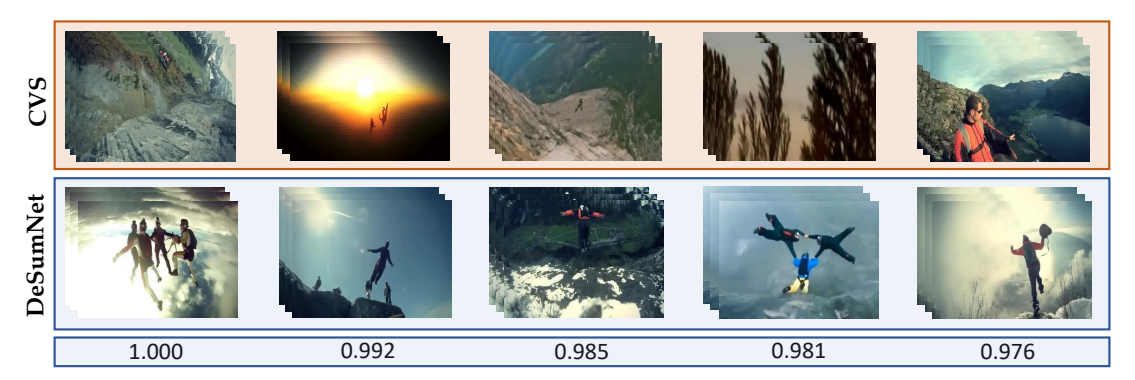
Figure 3. Exemplar video summaries generated by CVS and DeSumNet, along with our predicted spatio-temporal importance score ∈ [0,1]. As can be seen, CVS often selects some shots that are irrelevant and not truly related to the base jumping category. Our method, DeSumNet, on the other hand, automatically selects the maximally informative shots by leaning what aspects are important in base jumping from a set of similar videos. We show the top-5 results represented by three central frames from each shot. Best viewed in color.