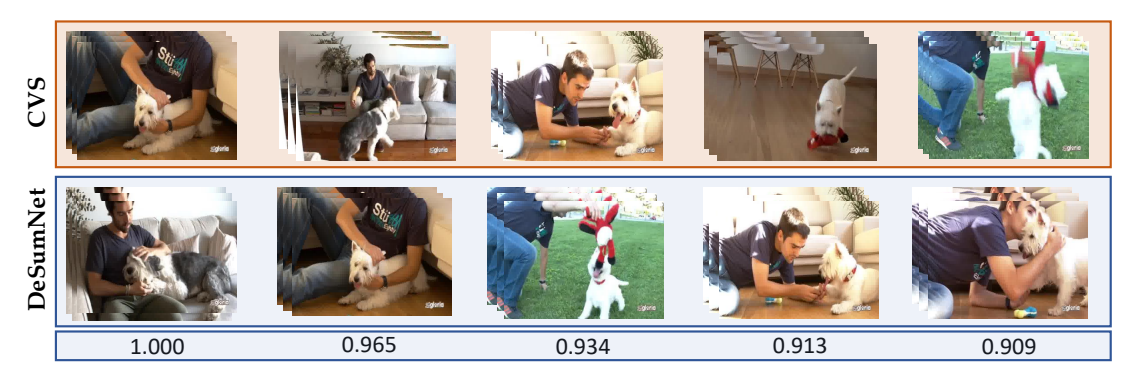
Figure 4. Exemplar summaries generated while summarizing a video of the category Grooming an Animal from the TVSum dataset. This video records very diverse contents and the scenes change frequently among the indoor house and the outdoor field. For these reasons, we found the returned summaries of our method and CVS to be largely similar. See text for more details. Best viewed in color.